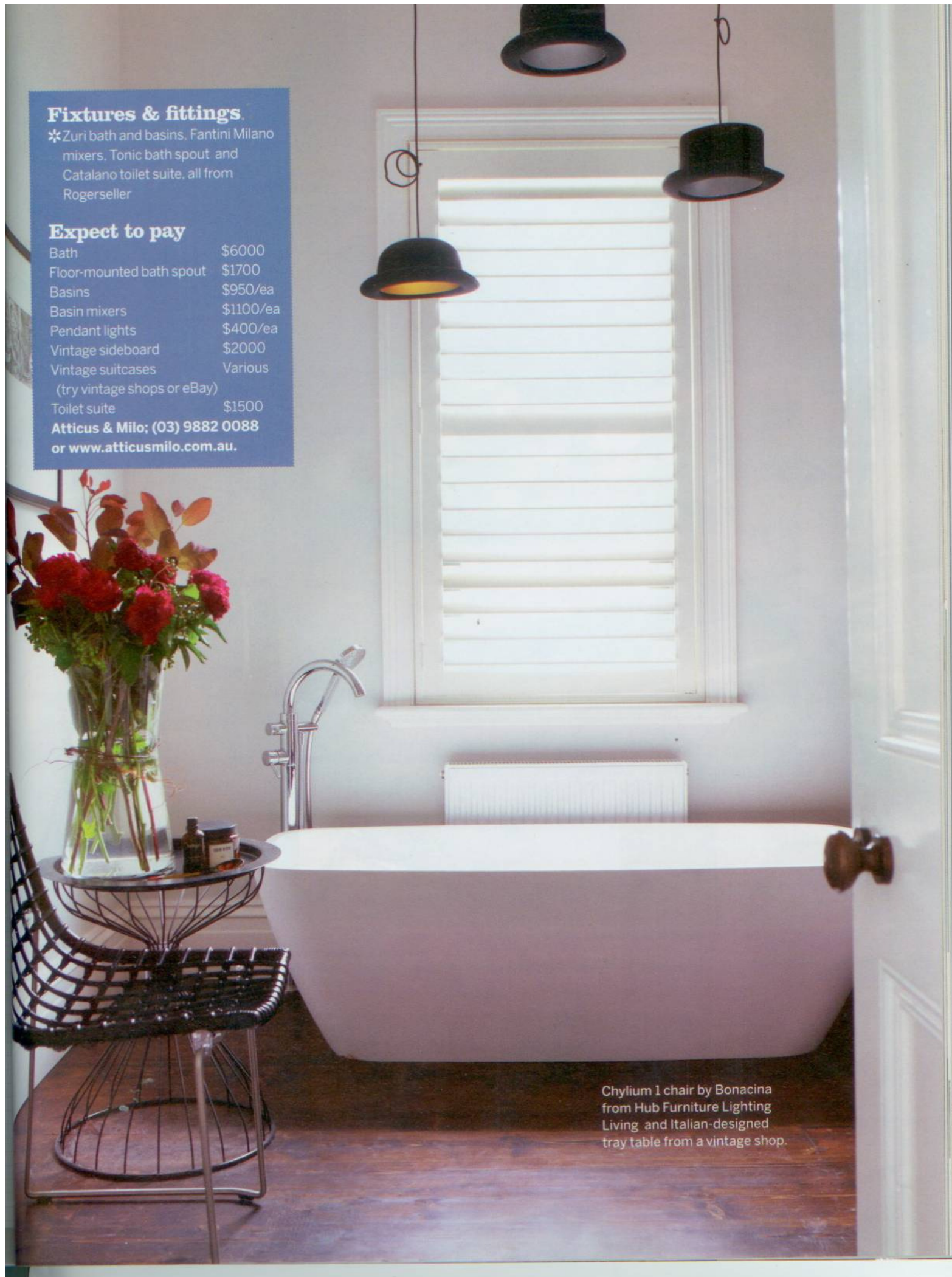
Chylum 1 chair by Bonacina from Hub Furniture Lighting Living and Italian-designed tray table from a vintage shop.