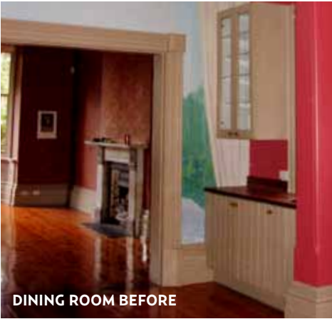
DINING ROOM BEFORE

‘THE POOL WAS DESIGNED TO PRESERVE THE 120-YEAR-OLD PEPPERCORN TREE THAT IT WRAPS AROUND.’ CAECILIA